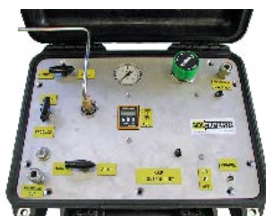
Pump control unit in two versions (low P = up to 17 bar, high P = up to 35 bar)