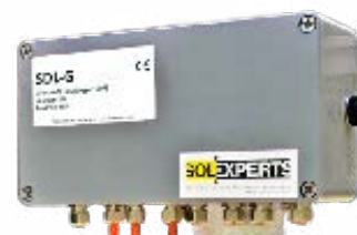
Stand-alone data logger